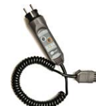
WS-03 adapter with START button with UNI-Schuko plug (CAT III 300 V)