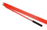
Foldable pin probe, 1 kV, 2 m (banana socket)