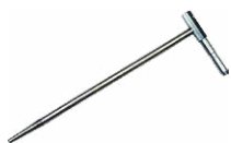
2x earth contact test probe (rod), 30 cm