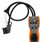
EVSE-01 adapter for testing vehicle charging stations