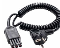
WS-04 adapter with UNI-SCHUKO angular plug