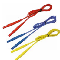
Test lead 1.2 m (banana plugs) red / blue / yellow