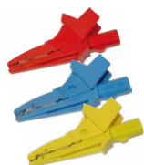
Crocodile clip 1 kV 20 A red / blue / yellow