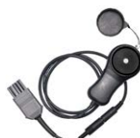
LP-10A light meter probe with WS-06 plug