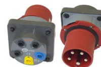
Three-phase socket adapter 63 A