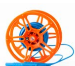
Test lead 15 m, blue (on a reel)