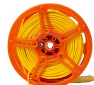
Test lead for earth resistance mea- surement 50 m