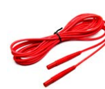
Test lead for fault loop measurement (banana plugs) 5 m / 10 m / 20 m