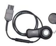
LP-1 light me- ter probe with WS-06 plug