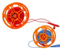
Test lead for earth resistance measurement 25 m red / blue