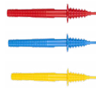
Pin probe 1 kV (banana socket) red / blue / yellow