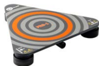
PRS-1 resistance test probe